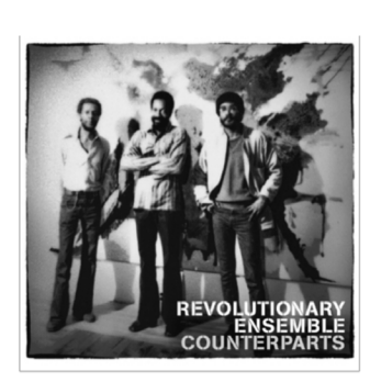
REVOLUTIONARY ENSEMBLE: COUNTERPARTS

Documents the last live performance by the legendary Revolutionary Ensemble-Leroy Jenkins (violin); Sirone (bass); Jerome Cooper (drums, balaphone, chiramia, Yamaha PSR 1500) - Genoa, Italy. November 25, 2005.